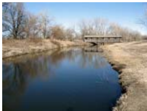
South Bridge Shallows