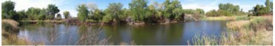
Big Slough Pond