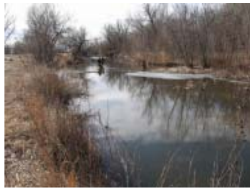
Run Above Concrete Dam