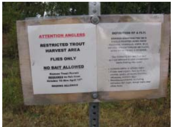
Sign Posting the Rules at Slough Creek