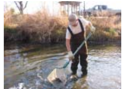
Stocking the Gazebo Hole