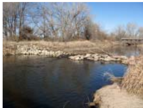
End of the Road 13th St Hole