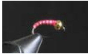
Eric's Pink Midge