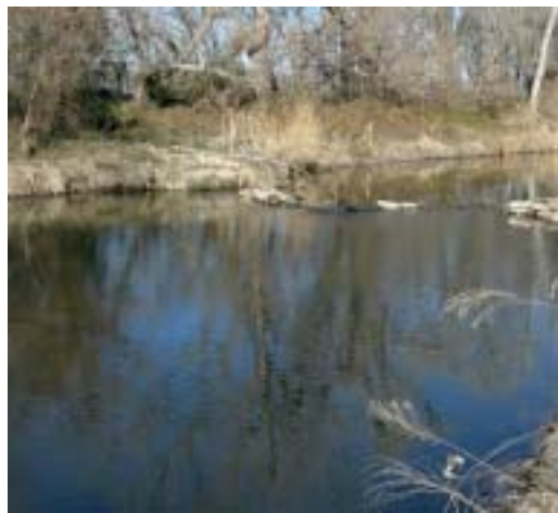
20 Inch Hole.