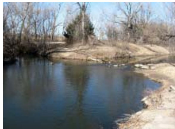
Bait Shop Hole