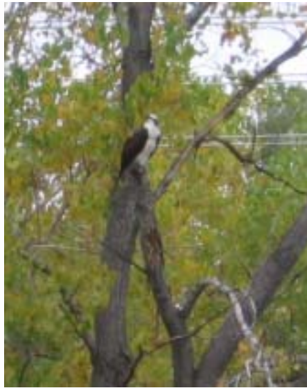
Osprey at the Big Slough Pond

The names of the pools have been named by a lot of people and are the most common names I know of. They are just something to use as a location for fishing reports, newsletter articles, etc. They are not official in any way.